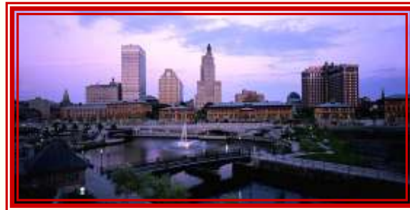
Providence in 2013 or 2014 !?!?